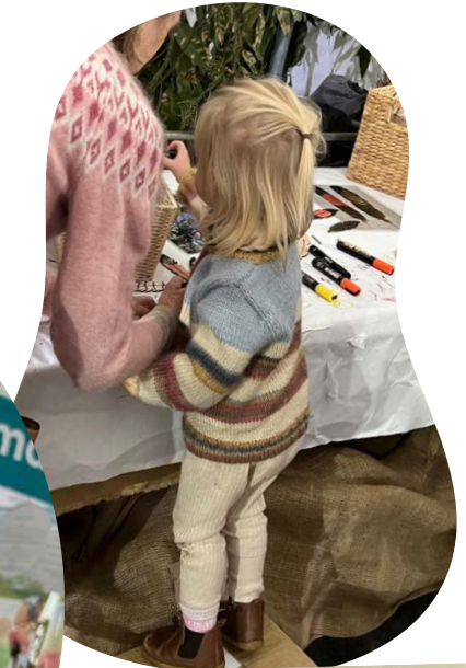
Colour a red tail feather