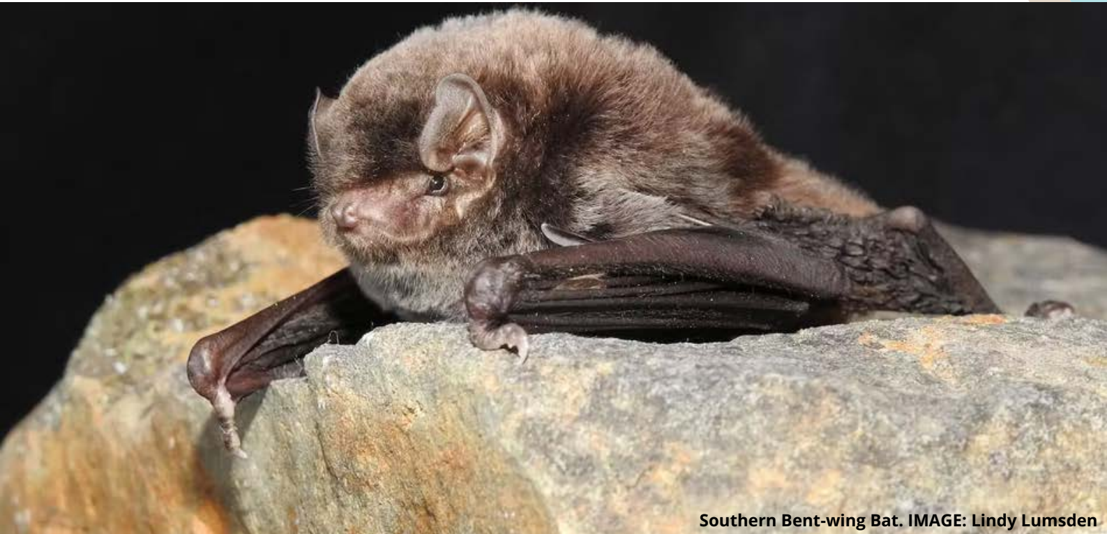
Southern Bent-wing Bat. IMAGE: Lindy Lumsden