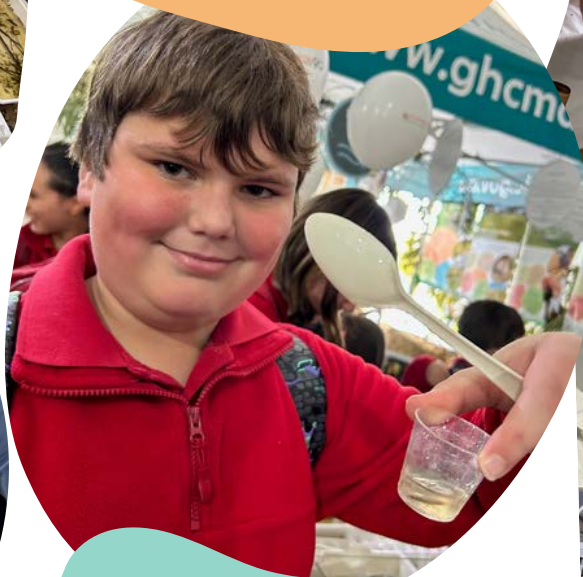
GHCMA colouring books