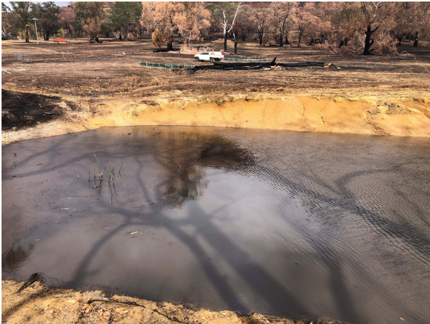
ABOVE: Dam post-rainfall with sediment control. BELOW: A dam which did not have sediment control nearby post-rainfall event.